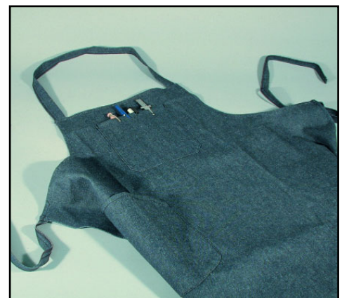
Hand-stitched in denim, durable, washable, features two pockets and attached heavy duty tie.