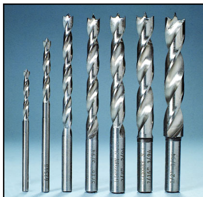
Set includes 1/8", 3/16", 1/4", 5/16", 3/8", 7/16" & 1/2" Spur Drill Bits. Bits fit any drill with 3/8" or larger chuck