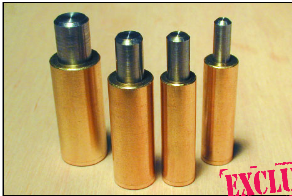
FROM LEFT TO RIGHT: WPRP .250, WPRP .187, WPRP .156 and WPRP .125.

These quality pins are used for locating and registering parts, mainly used in the blister packaging industry.