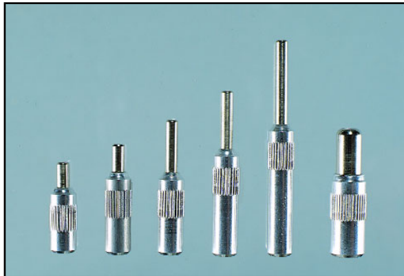
FROM LEFT TO RIGHT: P-100, P-102A, P-102, P-101, P-104 and P-132.