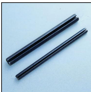
Spring Pins - Packaged in 1,000 quantities. Sizes: 1/8", 3/16", 1/4" or 3/8" diameter by 2" long. Used as stripping pins.